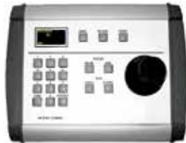
Viper PTZ Multi-function Desktop Controller

Works with all Viper models Three axis proportional joystick for precise control of pan, tilt and zoom functions. Bright OLED display. Simple setup of presets and tour functions. Supports Viper field firmware upgrades.