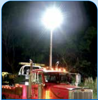
Night Scan® HDT