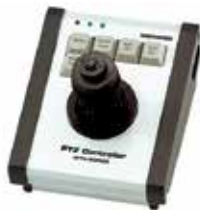
Wonwoo PTZ Mini Controller

Works with all Wonwoo models 3-Axis joystick control of PTZ functions. Preset position control (4 positions). IR ON / OFF button. Fan & heater ON / OFF function. Slave keyboard support.