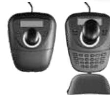
The Pelco-D Compatible Controller with LCD screen

Works with all Viper models Three axis proportional joystick for precise control of pan, tilt and zoom functions. Bright OLED display. Simple setup of presets and tour functions. Supports Viper field firmware upgrades.